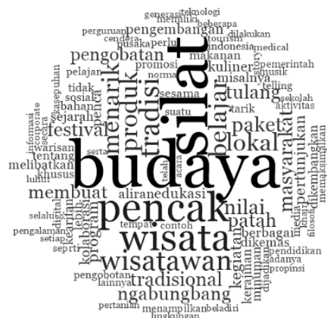
Figure 4. Word cloud

The word cloud analysis highlighted several frequently referenced terms, including culture ( budaya ), Pencak Silat , tradition ( tradisi ), learning ( belajar ), products ( produk ), and value ( nilai ), which were central to the study's findings. Following the organisation of datasets by file type and format to facilitate coding, each dataset underwent meticulous review and interpretation to uncover underlying meanings. The subsequent coding process, structured around predefined thematic categories, revealed diverse aspects of Cimande's Intangible Cultural Heritage (ICH) with potential for development and revitalization, as identified by research participants. These findings were further categorised into the most frequently emphasised areas: cultural ideas, cultural activities, and tangible cultural products.