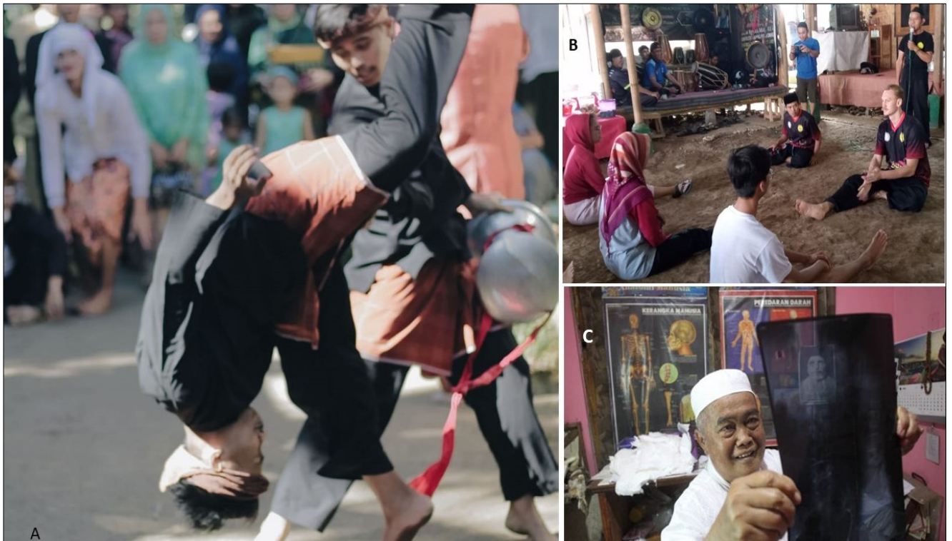
Figure 3. A. Parebut Seeng movement, B. Tourists learning Pencak Silat, C. Examine the X-ray result before performing traditional bone-setting treatment in Cimande

Cimande is derived from the local West Javanese phrase Ci-Man-De , an abbreviation of ciri iman anu hade , which translates to "signs of people with strong faith." The village is distinguished by several unique and compelling elements