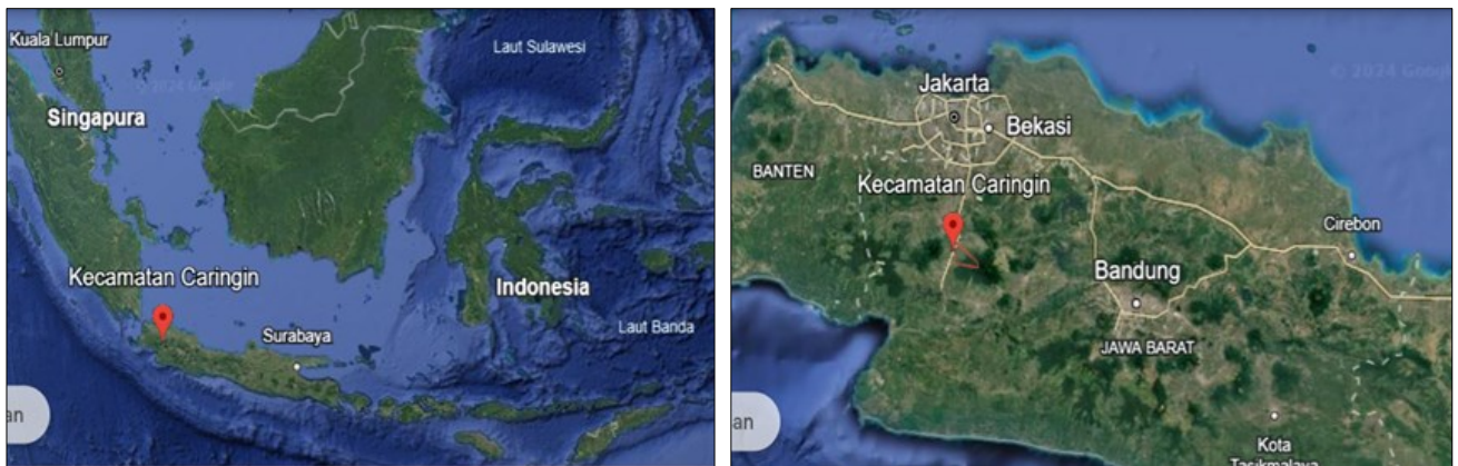
Figure 2. Cimande Village on Indonesia Map and Java

Cimande Tarikolot Village is within the administrative jurisdiction of Caringin District, Bogor Regency, West Java, Indonesia. Its geographical boundaries include Ciderum Village to the north, Pancawati Village to the west, and Lemah Duhur Village to the south. Nestled between the majestic peaks of Mount Pangrango and Mount Salak, the village is renowned for its stunning natural vistas and pristine air quality. Spanning an area of approximately 252 hectares, Cimande Village supports a population of roughly 6,800 residents. Figure 2 displays the position of this village on the Indonesian map.